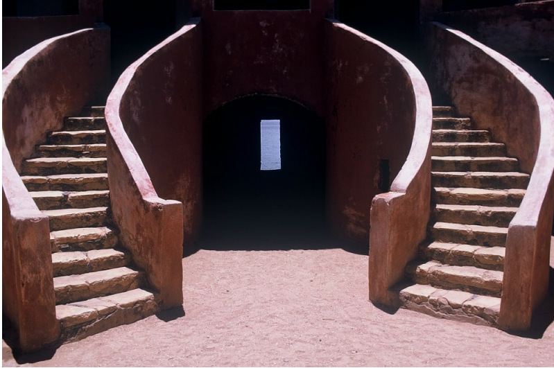
Entrance of the House of Slaves on Gorée Island. Photo taken by Eliot Elisofon during his trip to Africa from March 17 to July 17, 1970

plantations and museums (around slavery, African American or Japanese American heritage, or The National Memorial for Peace and Justice in Montgomery, Alabama, where each of the counties where a lynching occurred is invited to reclaim the steel slab bearing the name of the victim, among the 4,400 on display.)