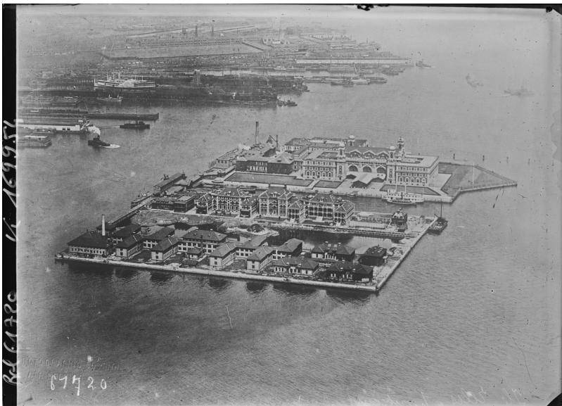
Aerial shot of Ellis Island, 1920