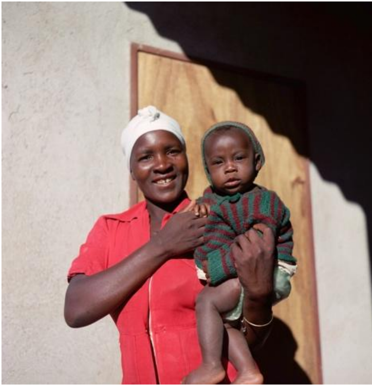
Todd Webb, Untitled (44UN-7994-515), Northern or Southern Rhodesia (Zambia or Zimbabwe), 1958. Woman in red dress with a baby