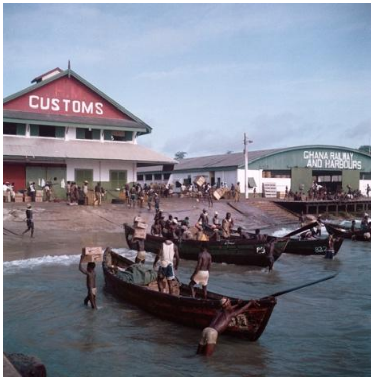
Todd Webb, Untitled (44UN-7997-226), Ghana, 1958. Unloading cargo with Customs House and Ghana Railway and Harbours in the background, Accra