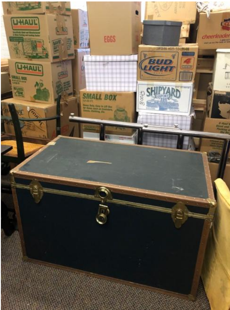
Steamer trunk with Todd Webb's negatives from the UN commission in Africa