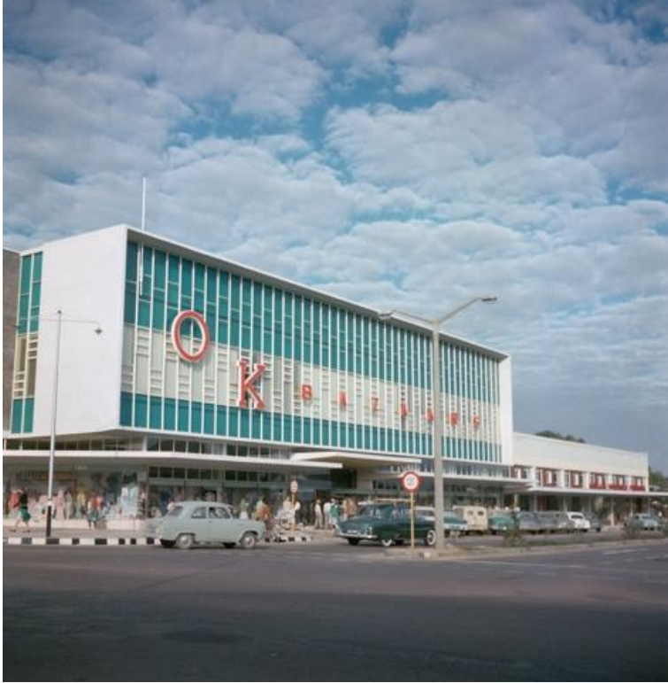
Todd Webb, Untitled (44UN-7982-128), Northern Rhodesia (Zambia), 1958. OK Bazaars in Kitwe town

because civil war is coming, and a bush war is the antithesis of what Webb is shooting." 21