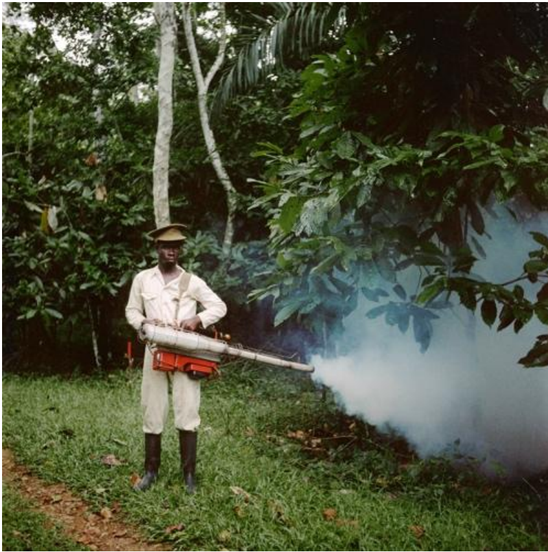
Todd Webb, Untitled (44UN-7776-038), Ghana, 1958. Spraying pesticide on cocoa crop