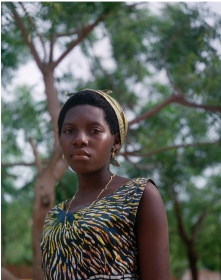
Todd Webb, Untitled (44UN-7907-144), Togoland (Togo), 1958. Portrait of a woman