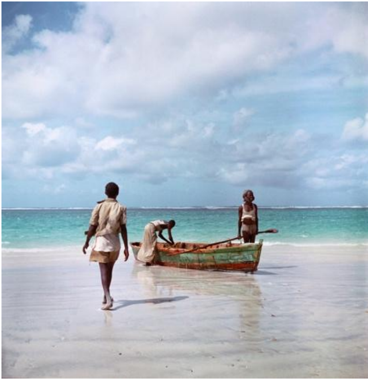
Todd Webb, Untitled (44UN-7967-001), Somaliland (Somalia), 1958. Men with fishing boat, near Mogadishu