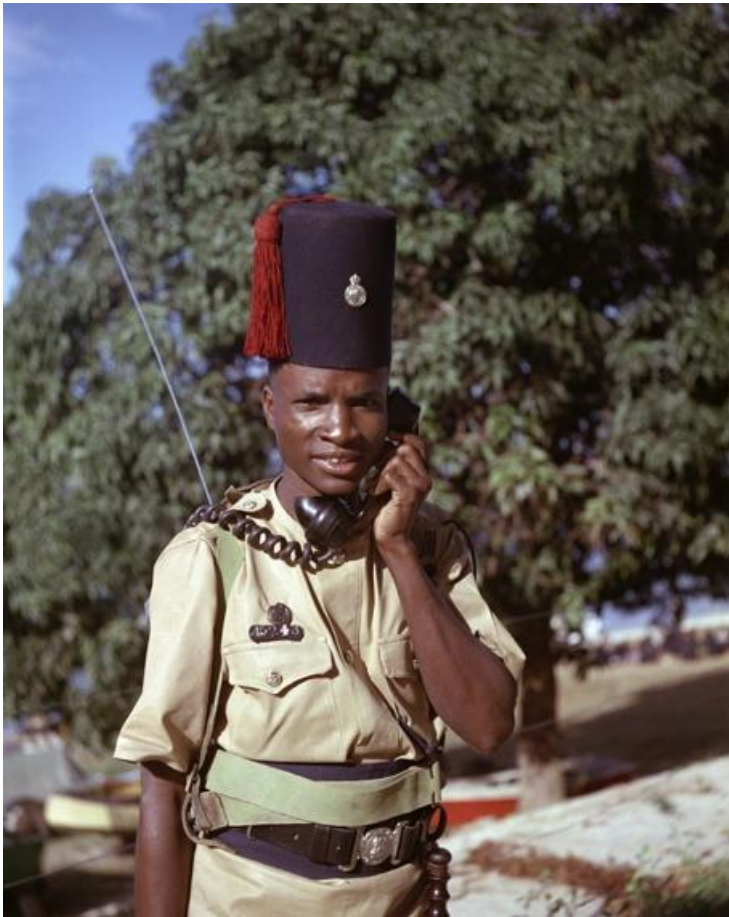
Todd Webb, Untitled (44UN-8021-415), Tanganyika (Tanzania), 1958. Tanganyika Police Officer using field telephone