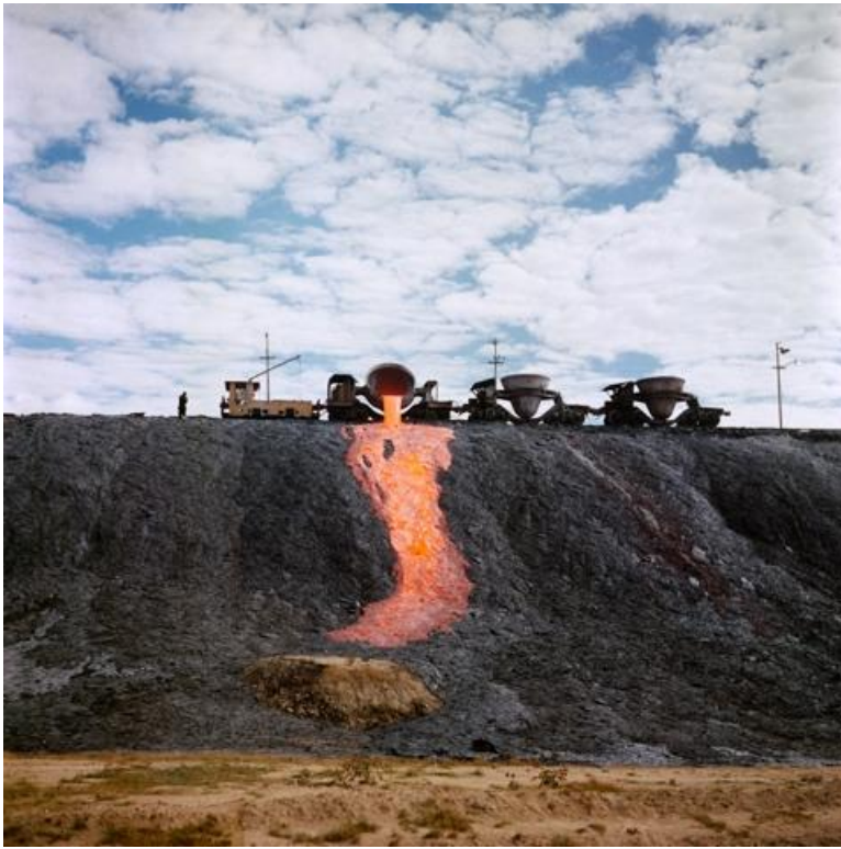
Todd Webb, Untitled (44UN-7981-177), Northern Rhodesia (Zambia), 1958. Molten slag running down a hill at a copper mine, near Ndola