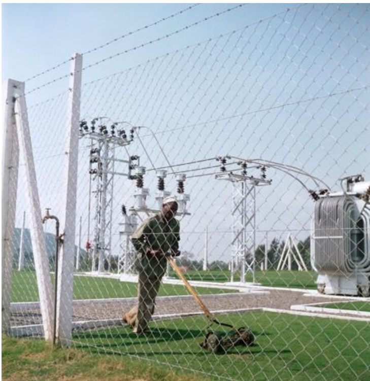
Todd Webb, Untitled (44UN-8011-469), Tanganyika (Tanzania), 1958. Man

Indeed, Webb's images, like one of the Pangani Falls hydroelectric power station, reflect a different photographic story of the continent than was imaged through other outsiders' lenses at the time. This photograph, which was not reproduced or published until 2021, shows a chain link fence separating the power plant from its worker. Two rows of barbed wire sever a corner of sky at the top of the photographic frame, and expose a triangular section of earth at the bottom that has been left ungroomed, dry, and patchy. Connecting the green grass to a cloudless sky, the shiny serpentine coils promise a pristine landscape where even the earth and air feel groomed. In contrast to the sleek technology of the power station towers, which seem to pulse with energy, a man in an olive colored suit and white hat pushes a lawnmower.