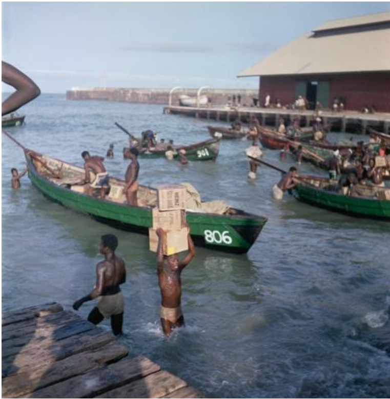
Todd Webb, Untitled (44UN-7913-191), Ghana, 1958. Unloading cargo from the boats, Accra harbor