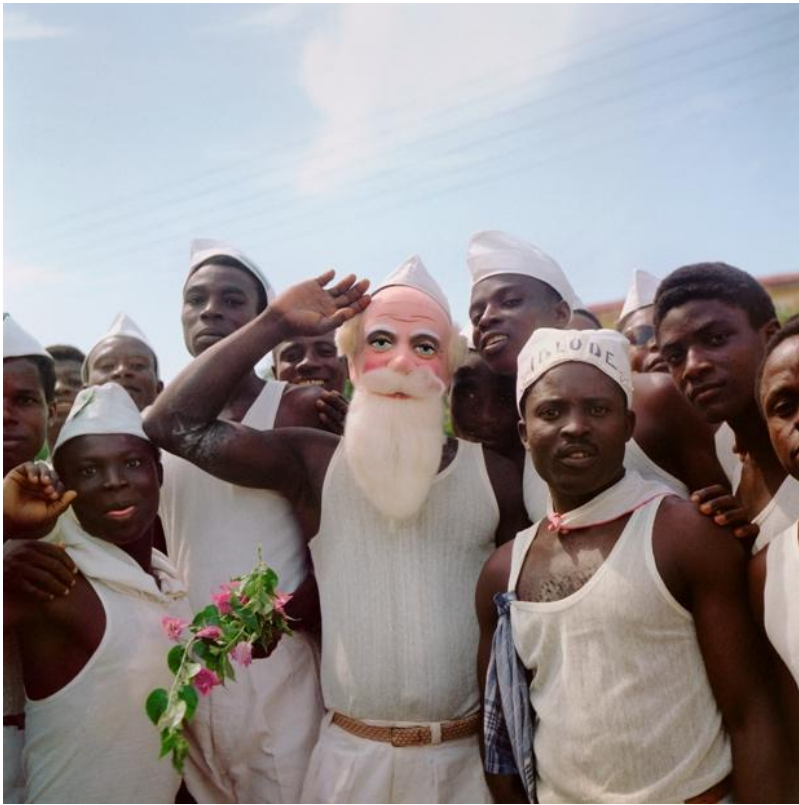
Todd Webb, Untitled (44UN-7925-071), Togoland (Togo), 1958. Group of men with white hats, one with the slogan "Ablode" (freedom), and a Santa Claus mask on election day, 27 April 1958.