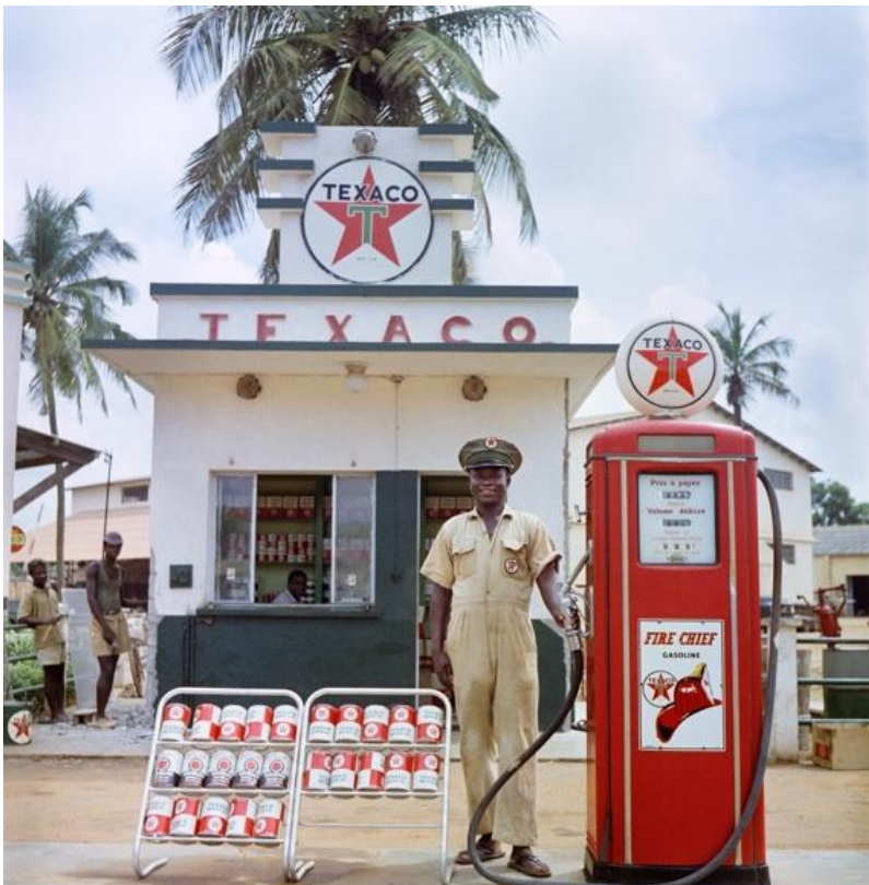
Todd Webb, Untitled (44UN-8002-165), Togoland (Togo), 1958. Attendant at Texaco Station, Togo

Many of the images raise questions about positionality and privilege and illuminate the ways that photographs are multi-authored objects. In one image, a woman and baby from Northern or Southern Rhodesia (Zambia or Zimbabwe) directly return the viewer's (and photographer's) gaze and in another, a Texaco worker holds the gas pump, and seems to smile.