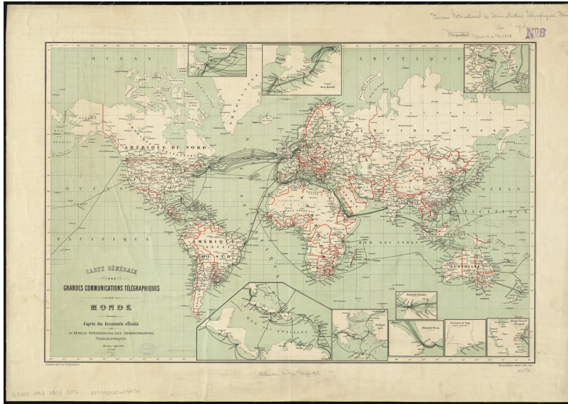
Carte des grandes communications télégraphiques

A new phase began in the 1850s and 60s, and corresponds to what has been called the second globalization—following the first one in the 15 th and 16 th centuries. While not the only region to participate, the Atlantic remained the center of this transformation. The steam revolution erased the slowness of earlier centuries, contributing decisively to a compression of distances. Steam led not only to an unprecedented increase in international commerce and circulation of material goods, but also to the great migratory wave from Europe to new countries on the American continents (the United States, of course, but also Argentina, Brazil, Canada, and Chile), from the beginning of the 1870s until the end of the 1920s, interrupted only by the First World War. Europe's colonial stranglehold on Africa was at its height during this period. Transoceanic telegraph cables—initiated in 1858 by the link between Valentia Island (west of Ireland) and Trinity Bay (east of Newfoundland)—reached their maximum expansion during this period, before being progressively replaced by the wireless telegraph.