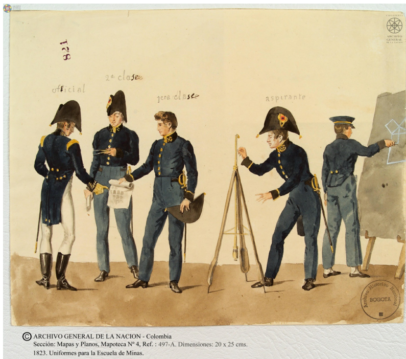
Uniforms of the Escuela de minas, attributed to François-Désiré Roulin, 1823