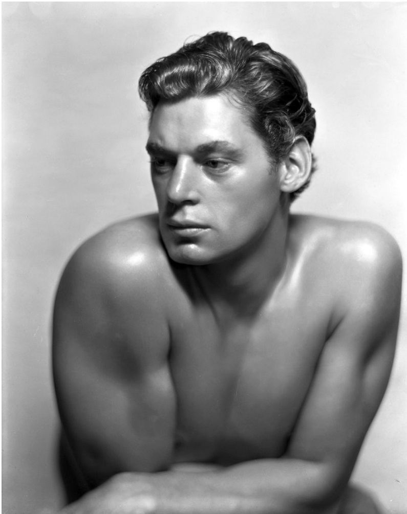
Johnny Weissmuller in Tarzan The Ape Man (Woodbridge Strong Van Dyke II, 1932)