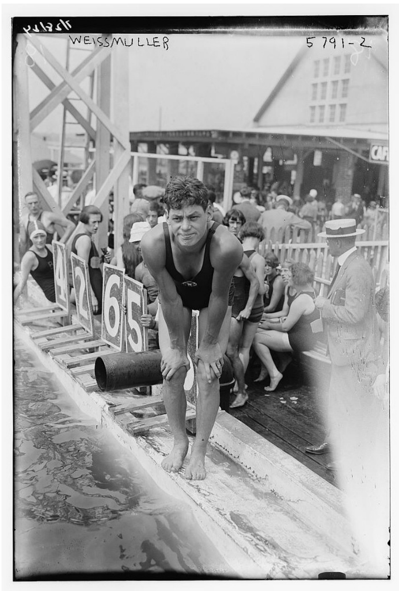
Johnny Weissmuller in Paris for the Olympic Games (1924)