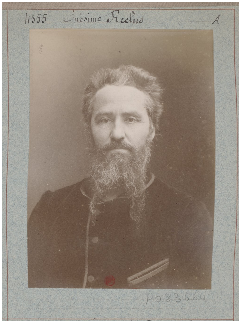
Onésime Reclus, [photograph, demo print], Nadar workshop

Reclus was a realist who believed that it was not the masterpieces produced in a language, but the number of speakers that would guarantee its perpetuation. He developed a very modern vision of what could be called anachronistically "cultural globalization", dreading a sort of linguistic uniformity born out of a kind of "cosmopolitanism" that would reduce all differences to a common "pidgin." 2 He thus identified the French ambivalence and ambiguity still known today, where the struggle to maintain cultural and linguistic diversity in the world is carried out through the defense and promotion of a language that is simultaneously dominant and threatened by other languages. This pioneering work, which nonetheless fell into relative obscurity after the First World War, is the beginning of a discourse that both rejects narrow-minded nationalism and exalts the greatness of the French language.