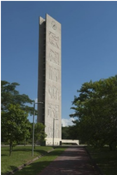
View of the Clock Tower on the Butantã campus of the University of São Paulo.