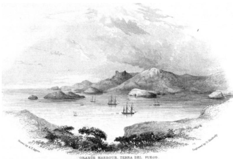
Source : Narrative of The United States Exploring Expedition (1838-1842). Philadelphia, Lea & Blanchard, 1845, p. 120.

Although the focus of many of those involved in going around the globe was on the Pacific, the US expedition, amongst others, spent some time in the Atlantic, where it carried out a hydrographic survey and revised inconsistent maps. The resulting work used the travel writings of other officers, particularly Europeans, who had initially surveyed coastal or submersed geographical landforms. Simultaneously, the expedition narrative recognized the achievements of Europeans, especially the English, the most important navy of the epoch, and established the United States as partners in the international scientific debate.