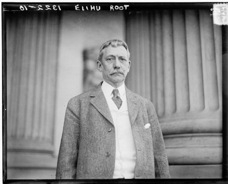
Elihu Root (undated)