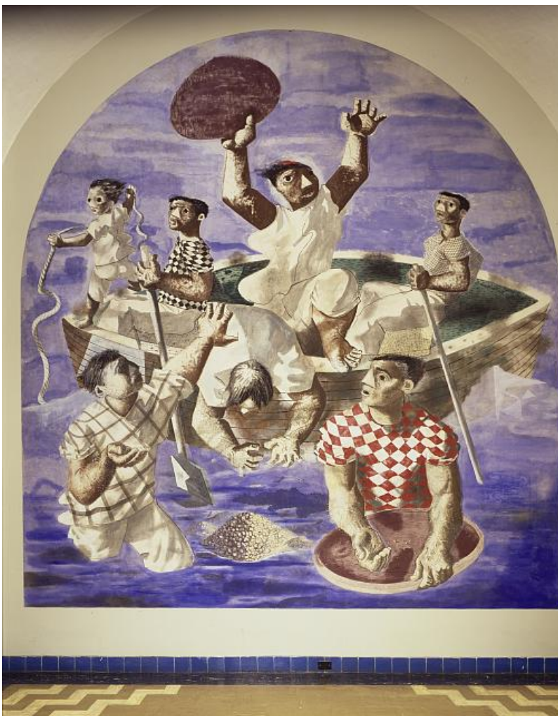
Candido Portinari's "Discovery of Gold" (1941). Mural painting in the Hispanic Reading room of the Library of Congress, Washington, D.C.

A mural in Los Angeles by David Alfaro Siqueiros, América Tropical (1932), was also destroyed. Developers creating a Mexican-themed shopping plaza commissioned the painter to create a large mural overlooking the space. Siqueiros placed the crucified body of an Indian at the center of his mural, surrounded by ruins of pre-Columbian buildings and sculptures. From the sidelines, snipers (identified with revolutionary movements in Mexico and Peru) took aim at an eagle hovering over the scene. When the unveiling of the mural occurred, critics in both the United States and Mexico hailed América Tropical as among the most important works yet produced in the Mexican mural movement. For the developers who commissioned the work, however, Siqueiros had ignored their commercial purposes. They had the mural whitewashed so its disturbing imagery no longer conflicted with festive promotion of shops and restaurants. Still, the fates of Rivera's Rockefeller Center and Siqueiros's Olvera Plaza murals were untypical of the dozens of murals that Mexican artists created across the United States in the 1930s. José Clemente Orozco's The Epic of American Civilization (1932-1934) at Dartmouth College in the state of New Hampshire, with its difficult treatments of the dehumanizing effects of modern war and industry, quickly became one of the most visited public art sites in the country. 3