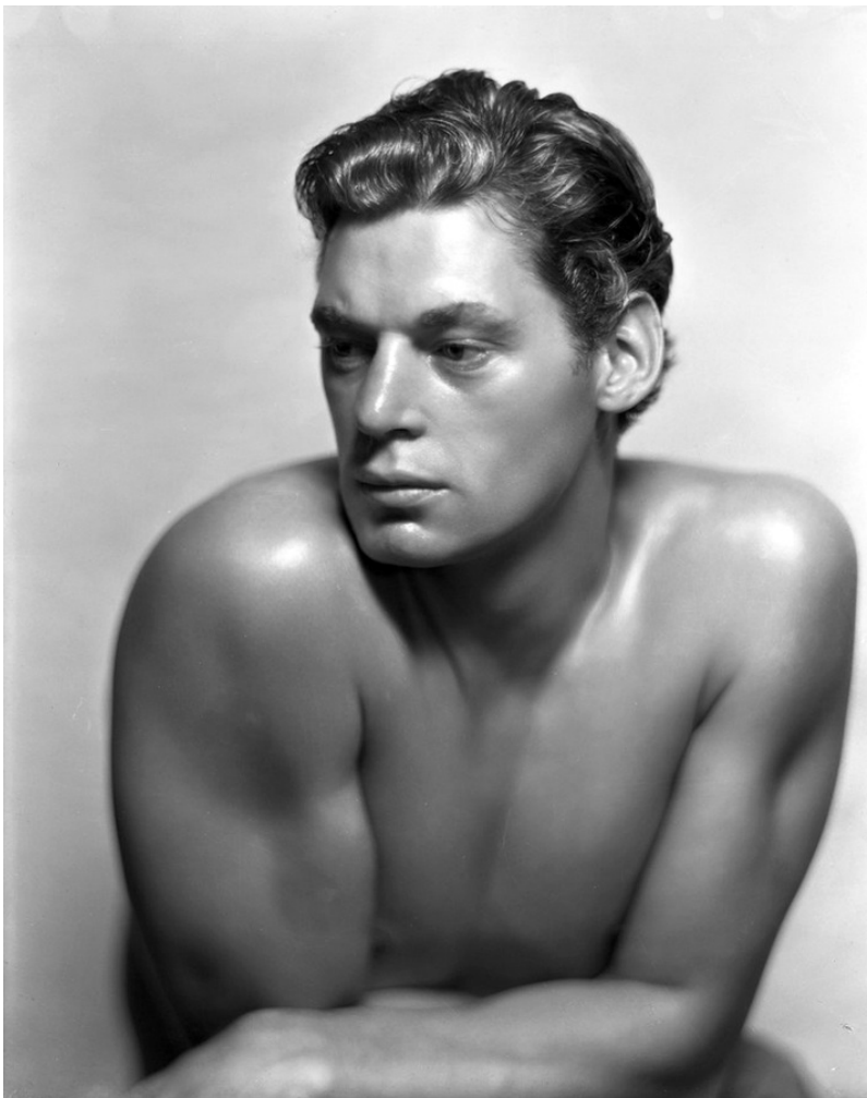
Johnny Weissmuller in Tarzan The Ape Man (Woodbridge Strong Van Dyke II, 1932)