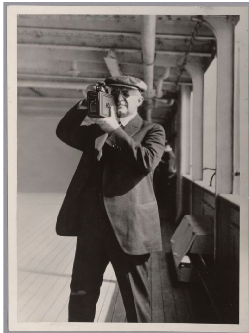
"George Eastman with motion picture camera"