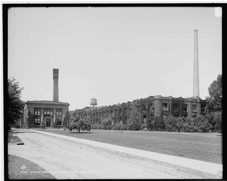
Kodak Park plant in Rochester, New York [Between 1900 and 1910]