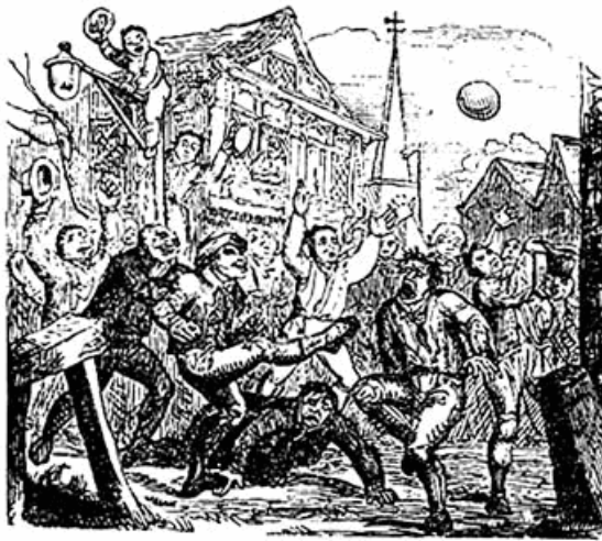
A folk or mob football game in London, 1721

general context where the idea of “muscular Christianity” gradually took hold. In this favorable environment, each college developed its own version of folk football, depending in particular on the space available for playing it. Increasingly precise rules emerged (the first for rugby date from 1845). Universities and clubs sped the movement’s momentum. Two main codes ultimately emerged: the “handling game” played in Rugby, where under certain conditions players were allowed to grab the ball by hand, and the «dribbling game,” which was favored by other public schools, including Harrow. They became rival sets of rules; when clubs or schools met on the playing field, first they had to settle the issue of which ones to use. After many trials, soccer took a major step towards autonomy when the Football Association was created, followed in 1871 by the Rugby Football Union (RFU). This is when the conflict over whether or not the players should be paid erupted, which led to two different results. While soccer averted an internal crisis by becoming professional, rugby’s governing bodies chose to keep the sport an amateur endeavor. The decision was opposed by some clubs in northern England, which split off from the RFU by creating the Northern Rugby Union (1895), giving rise to a new professional sport, 13-a-side rugby (rugby league). The southern clubs remained loyal to amateur rugby; 15-a-side rugby did not become officially professional until 1995.