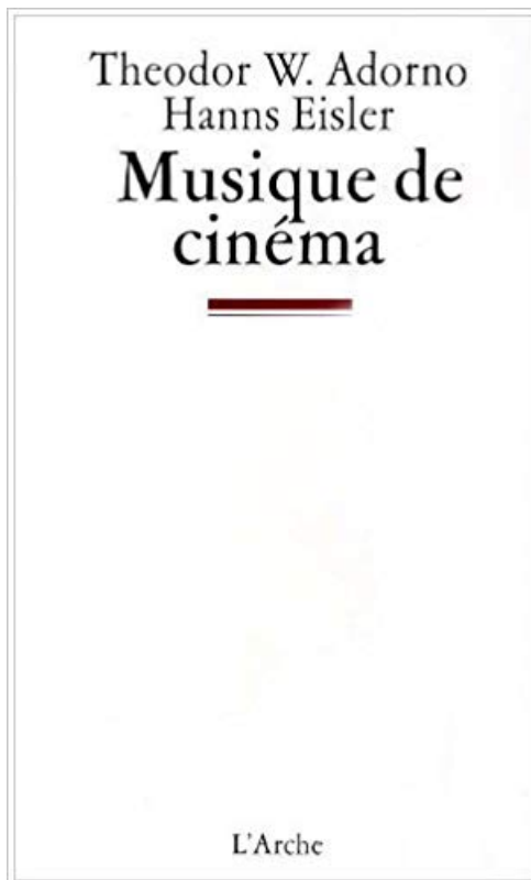
Cover of the French translation of Musique de cinéma [1944] by Theodor W. Adorno and Hanns Eisler. Paris, L'Arche, 1972

acquires in Wagnerian dramas. The authors also condemn Hollywood music's primary recourse to a "prefabricated" language inherited from Romantic music. This type of language, they say, conveys pre-established and fixed references, clichés and "automated associations" 15 , thus confining musical accompaniment to an imitative and descriptive role.