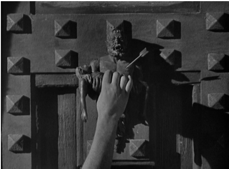
Ernest B. Shoedsack and Irving Pichel, screen shot from the opening of The Most Dangerous Game (1932)

This punctual emphasis of certain actions by music, which took the name of mickey-mousing in reference to Walt Disney's cartoons where the method was particularly widespread, is often criticized and reduced to the notion of music-image redundancy. The music does not, however, imitate; it completes and enhances the image through a process of stylization. In addition, mickey-mousing can be only punctual, or it can be a carrier of thematic or symbolic developments; thus, the musical emphasis on the heavy step of Kong is done using his descending chromatic motif, expressed from the opening credit sequence. 6 The Most Dangerous Game opens on a plaintive call of horns (downward minor third) before the closed door of a fortress, followed by tremolo chromatic rise, and interrupted three times by a hand pounding a knocker into the massive door.