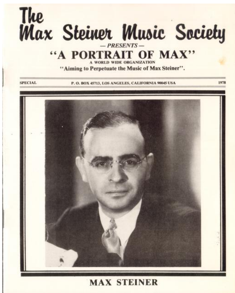
Max Steiner on the cover of a special edition of the Max Steiner Music Society, 1978