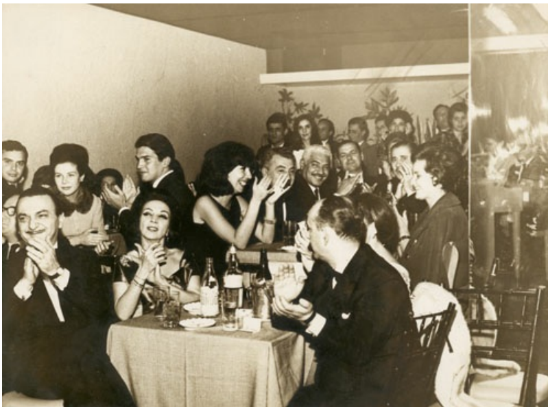
Show O Encontro (agosto, 1962)