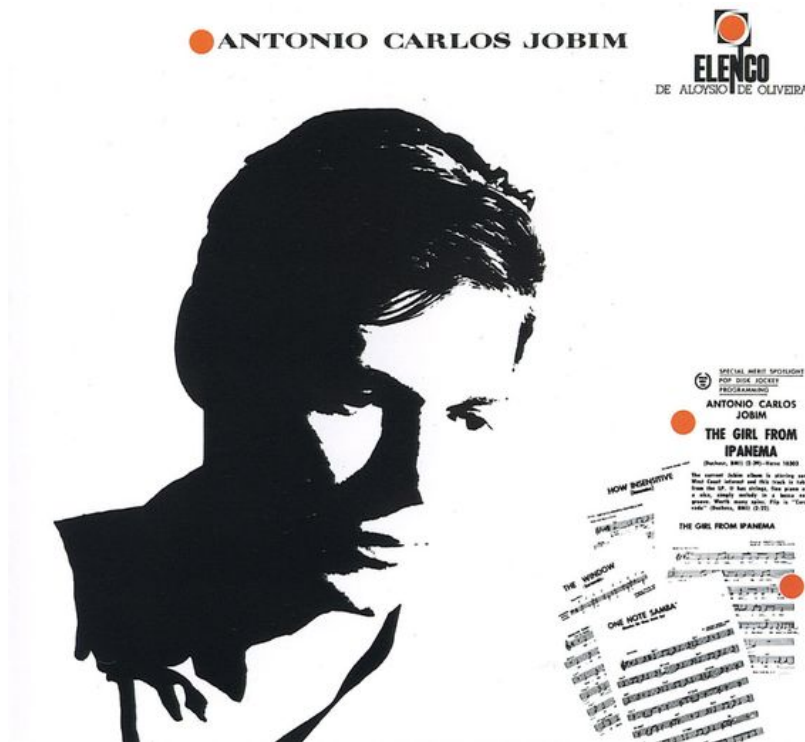
Cover of the Brazilian edition of Jobim's debut LP in the US.