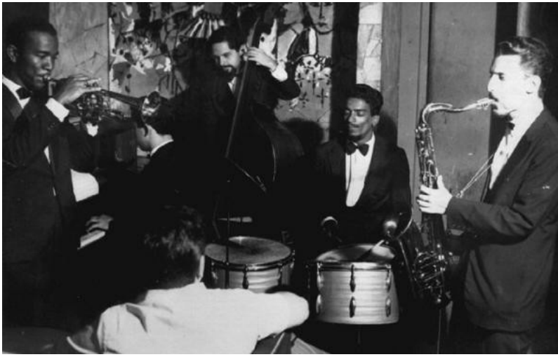
Beco das Garrafas (Rio de Janeiro)