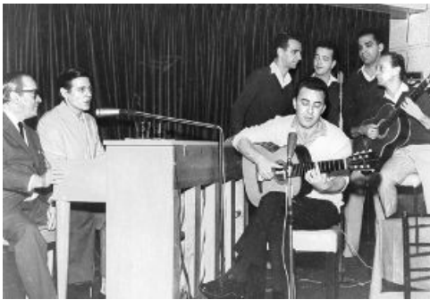
O Encontro (agosto, 1962). The principal names of bossa nova in an informal encounter which signified a moment of a greater projection of the style in Brazil until that moment.