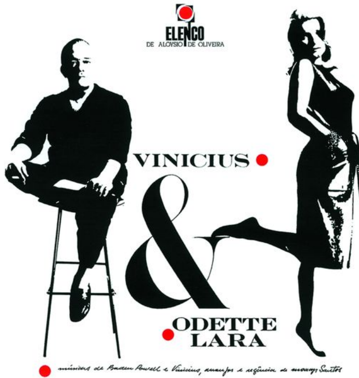
Cover of Elenco's debut LP: Vinicius de Moraes and Odette Lara.