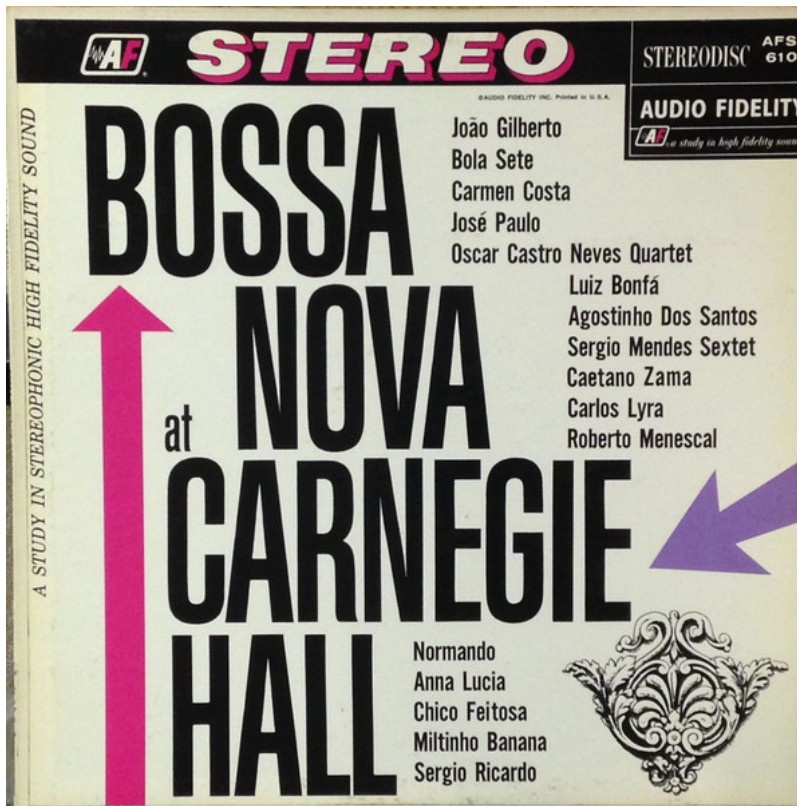
Bossa Nova "New Brazilian Jazz" concert in Carnegie Hall, 21/11/1962.