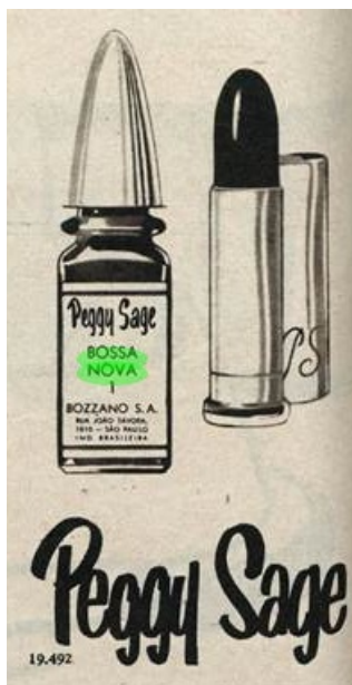
Bossa nova nail polish.