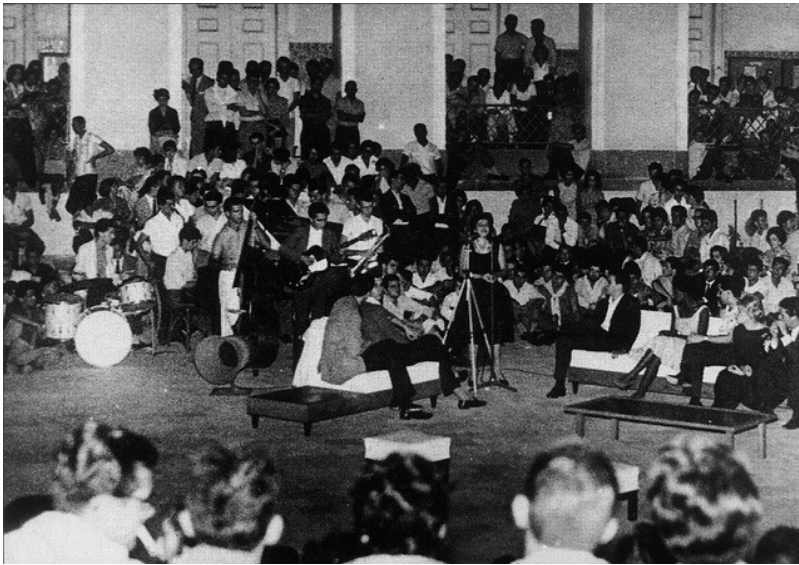
1st Samba Session Festival - School of Architecture, Universidade Federal do Rio de Janeiro, 22/09/1959