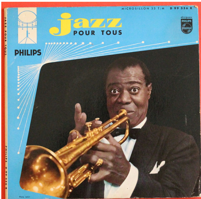
Louis Armstrong, record cover from the "Jazz for All" collection