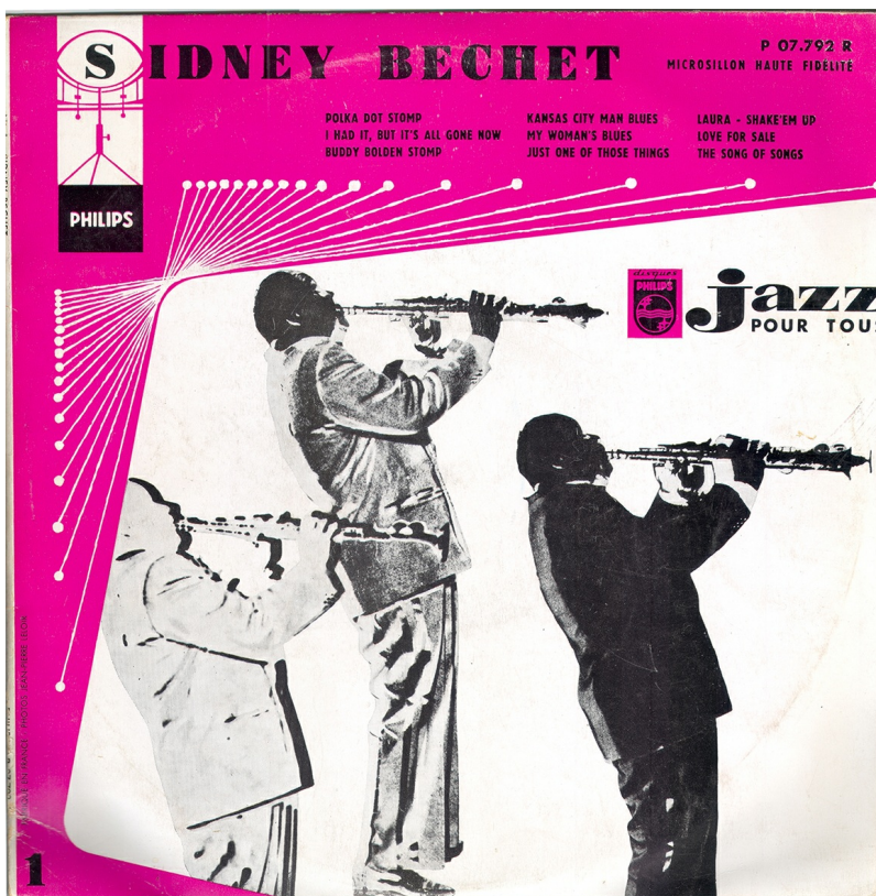
Sydney Bechet, record cover from the "Jazz for All" collection