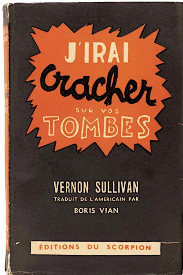
J'irai cracher sur vos tombes , Vernon Sullivan, translated from the American by Boris Vian, Paris: Les éditions du Scorpion, 1948.