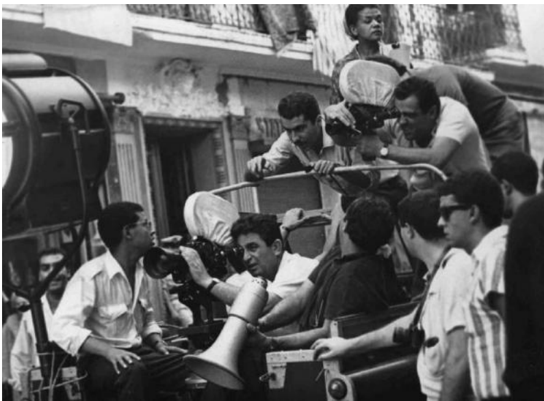
Sarah Maldoror, above, accompanying the filming of The Battle of Algiers , in 1966.