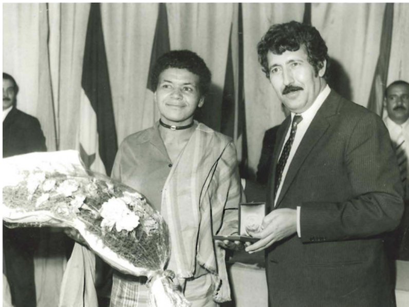
Sarah Maldoror receiving the award at the IV ème Festival of Carthage, 1972, for Sambizanga .

In 1972 the film won the Gold Tanit in the IV ème Festival of Carthage and an award in the IV ème Festival of Ouagadougou. However, it faced censorship in Portugal, where it was only released in October 1974, since the authorities argued that it sought to "prevent maneuvers of reaction and to create propaganda for one of the emancipation movements, still at war." Principally in Angola, the film suffered a series of retaliations, in accordance with Luandino Vieira's interview with Cine Cubano magazine, and in May and June 1975 fights broke out between those watching the film who accused each other of convenience with colonialism. For this reason, the writer stated, "we decided that the film would be reserved for later in the day, when some time could be spent to clarify for viewers the dynamics of the cinematographic process and education." 9 In the African country the film was only shown in restricted projection circles, with meetings of MPLA activists and social movements, and was banned from cinemas. Despite making two adaptations of the writings of Luandino Vieira and being the partner of MPLA's first leader, Sarah Maldoror denied that she had close ties with the party: "The contacts came from there [from Mário de Andrade], although I never participated in rallies or meetings." 10