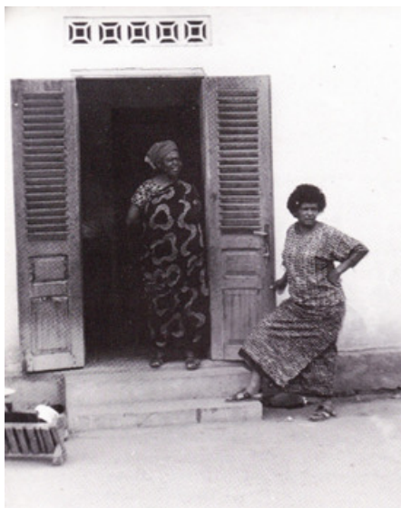
Sarah Maldoror, on the right, during the filming of Monangambee , 1968.

Monangambee was shown in 1970 at the XIIIe Journées internationales de court métrage de Tours and won an award at the 2 ème Festival International du Film d'Expression Française in Dinard, the 3 ème Festival International des Journées Cinématographiques of Carthage (Critics Prize), the Festival Panafricaine du Cinéma de Ougadougou (a Bronze Tanit in the short film category), and was exhibited in 1971 in the Filmmakers Fortnight at the Festival of Cannes, representing Angola.