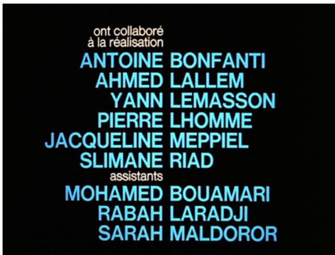
Photogram of Festival panafricain d'Alger (1969) by William Klein. Sarah Maldoror's name appears in the film crew.