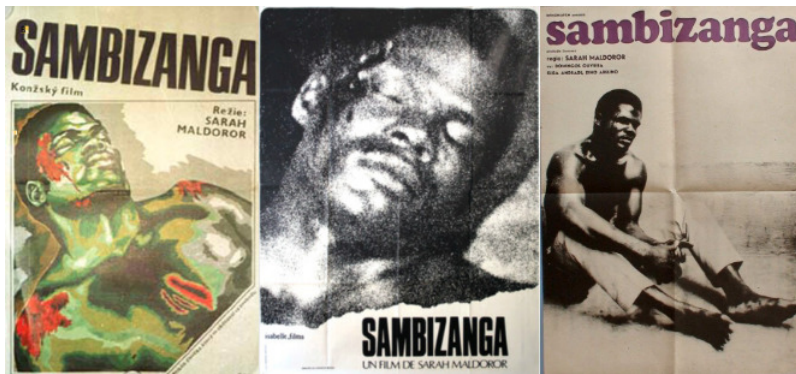
Publicity posters for Sambizanga .

Publicity for the film used the image of the sacrificed Domingos Xavier, despite the greater protagonism which women, especially Maria, had in the film.