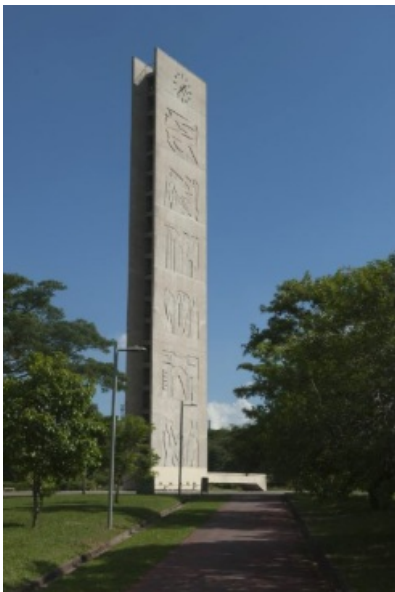
View of the Clock Tower on the Butantã campus of the University of São Paulo.