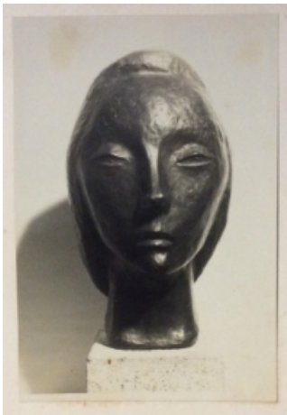
Elisabeth Nobiling. Portrait of Lúcia Suané, 1941. Bronze sculpture on granite base, 37 x 15 x 17 cm. São Paulo Museum of Art