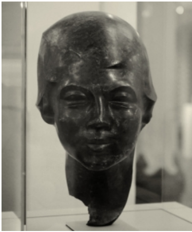
Edwin Scharff. Portrait of the actress Anni Mewes, 1917. Bronze. Karl-Ernst Osthaus Museum, Hagen