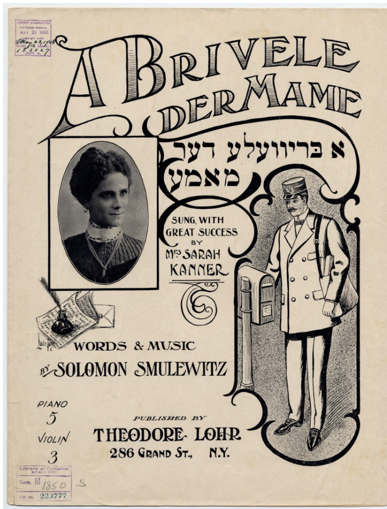
The score of A brivele der mamen