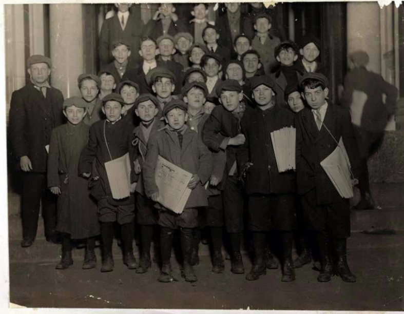
Forverts newsboys waiting for their copies, New York, March 1913

For example, in 1941, Brazil's nationalist dictator Getúlio Vargas banned the use of foreign languages in education and publishing, which led to the closure of Yiddish newspapers.