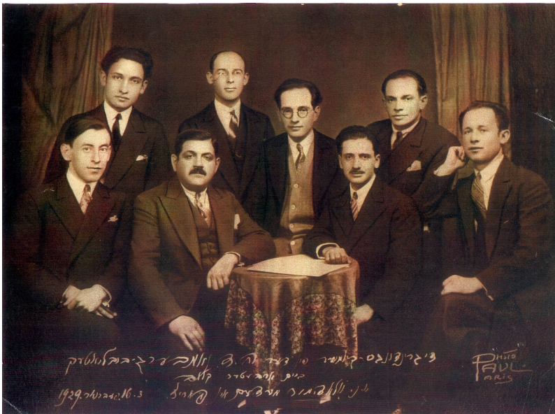
The founding committee of the Medem Library in Paris, 1929

In the late 19th and early 20th century, books culturally connected Yiddish-speaking communities to each other more than touring authors did. Yiddish culture first traveled from one continent to another through works that circulated widely between countries and across the ocean. They were sold in bookstores or could be read in or borrowed from Yiddish libraries that sprang up around the world. Readers found books published in the countries where they were living as well as abroad, mainly in Poland and the United States, which had the world's largest Yiddish-language publishing market. The same books could be found in São Paulo at the Biblioteca israelita (Jewish Library) founded in 1913, Paris at the bibliothèque Medem (Medem Library) created in 1928 by Bundist-leaning Polish immigrants and Buenos Aires at the Tsentrale yidishe biblyotek (Yiddish Central Library) established in 1939 by the Argentinean branch of YIVO .