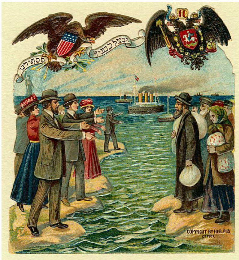
Greeting card depicting American Jews welcoming their counterparts from the Russian Empire, New York, Hebrew Publishing Company, 1909

They were just a small portent of things to come. In the 1880s, pogroms and anti-Jewish laws enacted after Czar Alexander II's assassination on March 1, 1881 spurred a massive wave of Jewish immigration from the Russian Empire. Between the early 1880s and 1914, roughly 1.6 million Russian Jews settled in the United States, where they were joined by around 380,000 more from the Austro-Hungarian Empire and 80,000 from Romania. Between 1899 and 1914, about 120,000 Central and East European Jews immigrated to Great Britain, 90,000 to Canada and Argentina, 30,000 to France, 25,000 to South Africa and 10,000 to Brazil. Outside the Atlantic space, approximately 70,000 settled in Palestine.