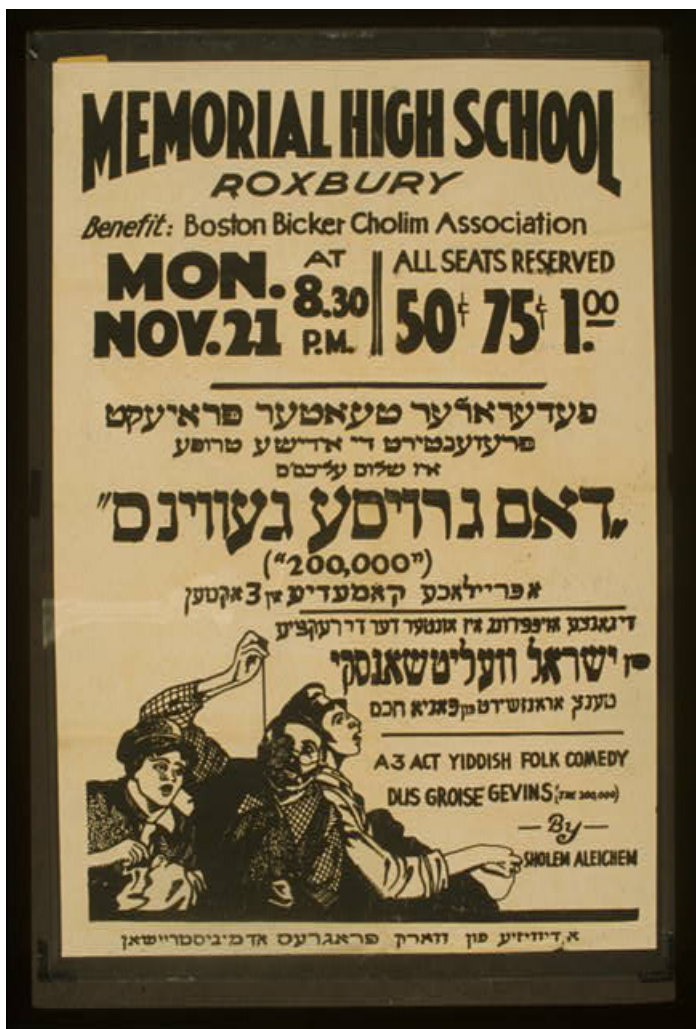
Poster for a Boston production of Sholem Aleichem's play Dos groyse gevins (The Jackpot), 1938