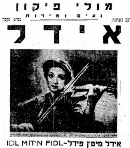
Advertisement for Yidl mitn fidl in the Hebrew-language newspaper Davar (created in Palestine in 1925), June 18, 1937