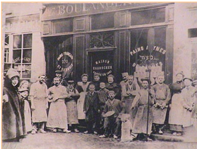
A Jewish bakery/pastry shop at 27 rue des Rosiers in the Marais neighborhood of Paris, 1895

In the neighborhoods where they lived (the Lower East Side of Manhattan, Praça Onze in Rio de Janeiro, Goes in Montevideo, Villa Crespo in Buenos Aires, Whitechapel in London and the Marais in Paris), Jewish immigrants created an intense community life through their language, which incorporated words in English ( biznis for business , fektri for factory ) or Spanish ( bayle for baile , bolitshe for boliche ). These words were helpful in engaging in everyday conversations in the new country's language and helped them integrate. Yiddish could be read on storefronts and heard with the inflections of Lithuanian, Polish and Ukrainian dialects in streets, sweatshops, stores, restaurants and apartment buildings. It was the language of the many institutions created to meet the needs of a population that, through its community life, built a microcosm continuously adapting to a new environment. Wherever they lived, the immigrants created the same organizations: synagogues, prayer halls, mutual social and financial aid societies, political groups, trade unions, youth movements, sports associations, book clubs, theaters, cinemas, newspapers and publishing houses (such as the Hebrew Publishing Company founded by Joseph Werbelowsky in 1900). Yiddish was always at least one of the languages used.